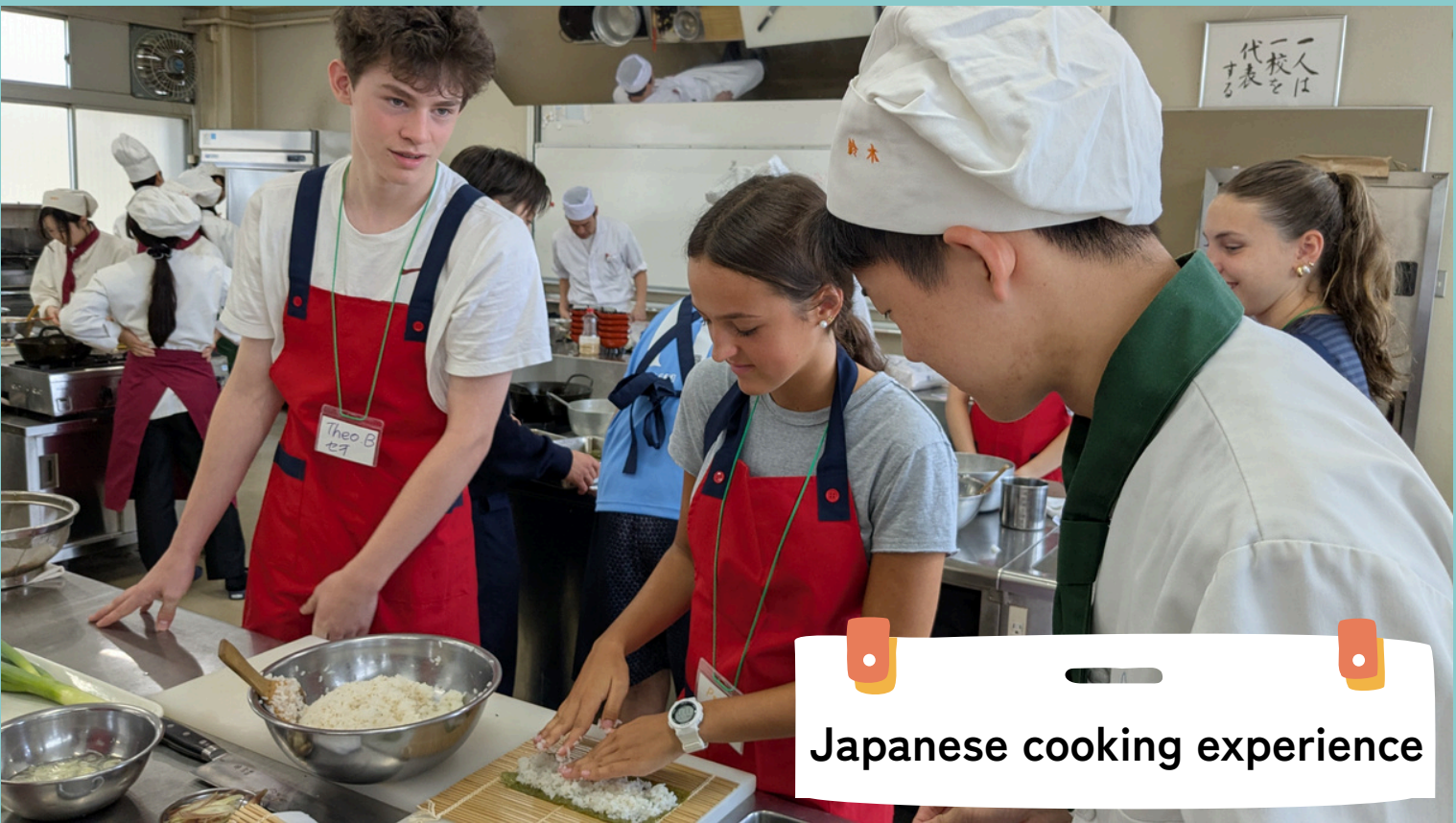
Japanese cooking experience