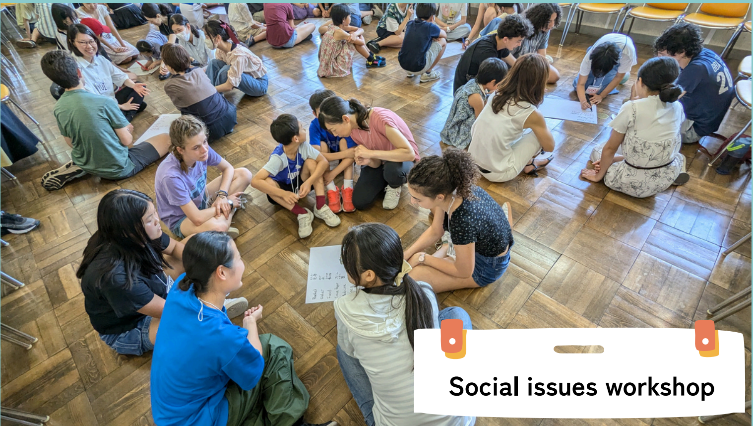
Social issues workshop