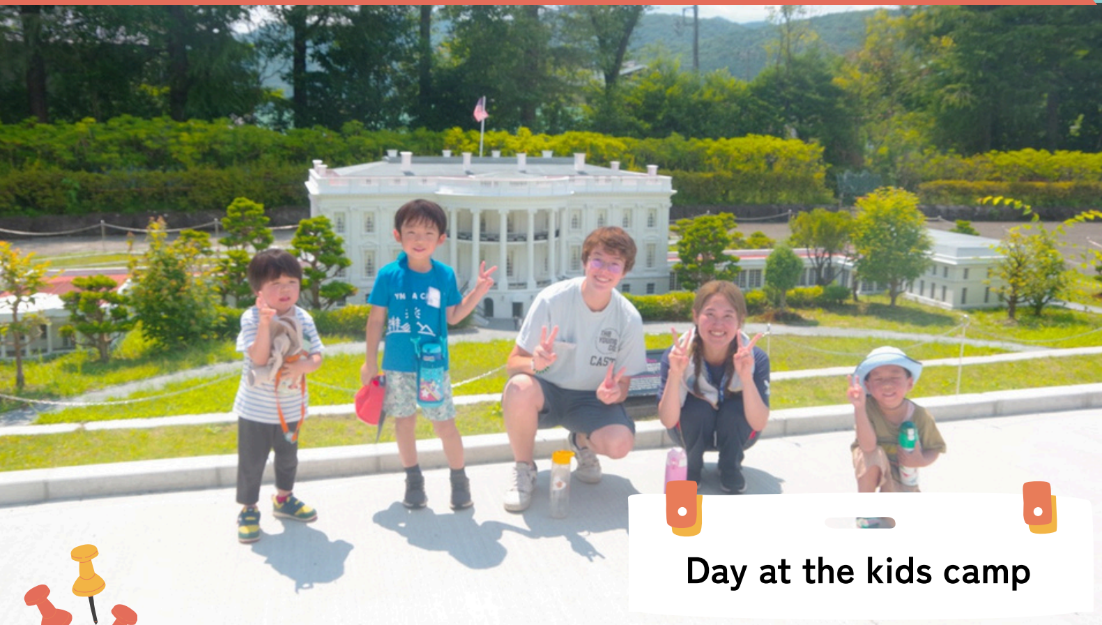
Day at the kids camp

You'll have experiences you can only find here